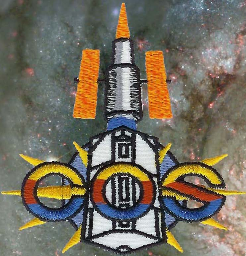
Polo and Accessories